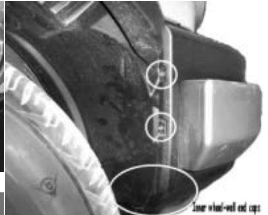
Photo 3 - Inner wheel-well attaching bolts and end cap attaching bolts (located under bumper) Do not remove inner wheel wells, let hang.