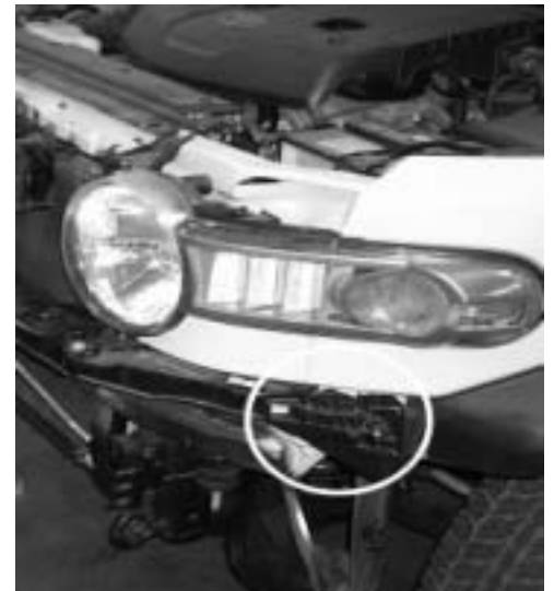
Photo 5 - Outer bumper support clips. These must be removed from both sides.

Photo 1 - Removing grill. Grill is attached with (2) push-pins, (2) screws, and (4) snap-clips (2 snap-clips per side).