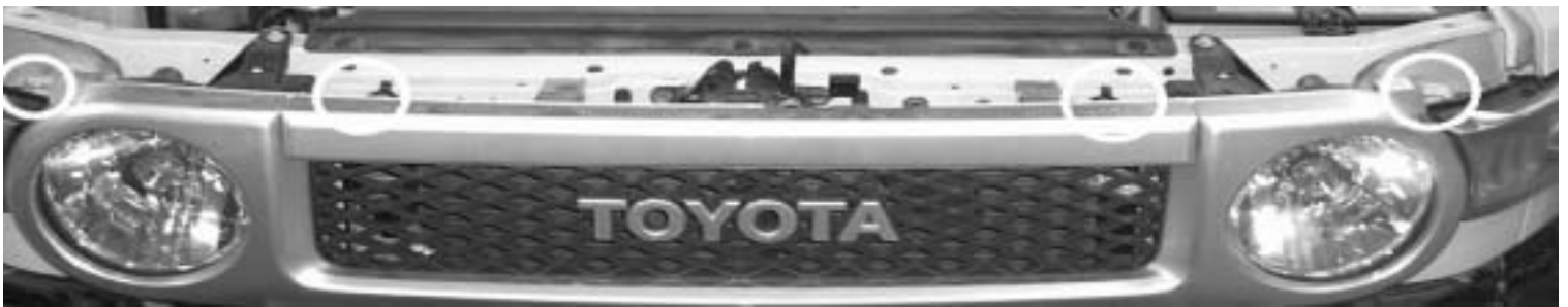
Photo 1 - Remove the "push-pins" from grill mounts outside of headlights. Remove the hold-down screws at the top inner edge of grill (all circled in white above). Remove the grill by popping the snap-clips (2 on each side just inside the headlights) and pull forward off your FJ.