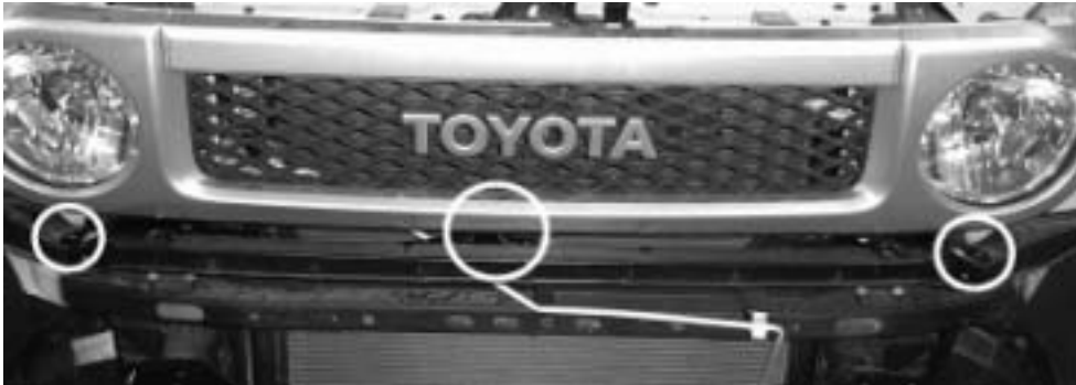
Photo 2 - Unclip bumper fascia from fascia support bracket through removed grill opening.