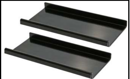
NATO Can Adaptors Part # 3201 Sold Separately (per pair)