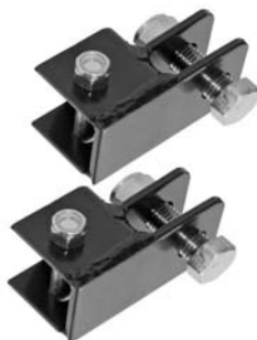
Towbar Adaptor Brackets Part # 3200 - vertical pin Sold Separately (per pair)