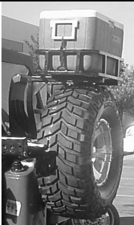
Cooler Rack for B/A Swing-A-Way Part # 5122 Sold Separately For up to a 32qt. Cooler

Accessories below also available separately to accent and / or outfit your Body Armor Bumpers - inquire with your Body Armor Dealer.