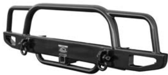
TJ-19331 - Triple Hoop Front Bumper

Check out our line-up of front and rear bumpers for your TJ* - Available Now!!!