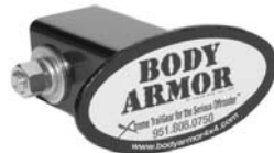
Body Armor Hitch Cap Part # 3207 Sold Separately