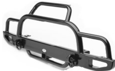
TJ-19431 - Quad Hoop Front Bumper