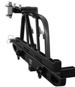
TJ-2491 - 54" Swing-A-Way Bumper TJ-2991 - 59" Swing-A-Way Bumper

Accessories below also available separately to accent and / or outfit your Body Armor Bumpers - inquire with your Body Armor Dealer.