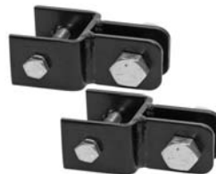
Towbar Adaptor Brackets Part # 3210 - horizontal pin Sold Separately (per pair)